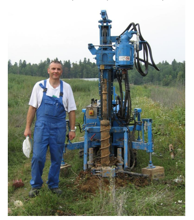
Figure 2. Borehole drilling on the top of MSW mass.

A start-record signal was sent to the computer via the USB interface by a cable synchronization system.