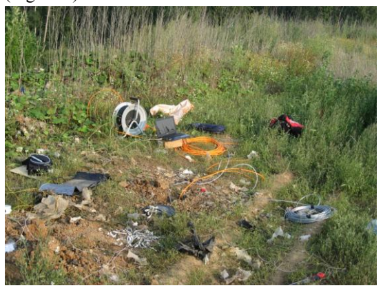
Figure 5. Set of equipment for vertical shot.

The measurements were carried out at 5 levels – 5.8 m, 4.5 m, 3.8 m, 2.8 m, 1.8 m. In each point the surveillance was done firstly when striking vertically (Figure 5) and then horizontally across the probe axis (left and right shots) and along the axis (forward and backward shots) (Figure 6). The shots were done straight near the wellhead and at the two offsets, of 2 and 4 m, respectively. During the measurements, the air-gas environment was monitored. The content of methane near the wellhead came to more then 2,81%, and that of hydrogen sulphide amounted 1,2% (Figure 7)