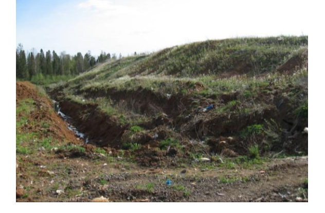
Figure 1. General view of waste mass.

Data were recorded with the sampling period of 0.25 ms and the record length of 4096 readings. 4-fold stacking was applied due to the low level of the ambient noise. External synchronization was provided by short circuit under the sensitivity equal to 1.