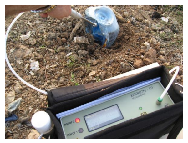
Figure 7. Air-gas environment control. Readings displayed on the monitor: TKD (metane) -2.81%, H_2S - 1.2\% .