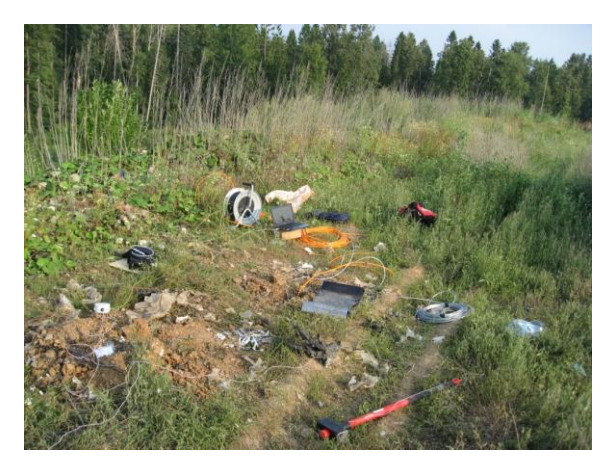
Figure 6. Set of equipment for horizontal shot.